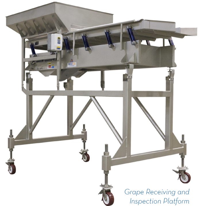
Grape Receiving and Inspection Platform (GRIP)