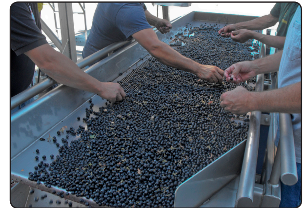
Post De-stemmer Sorting Table