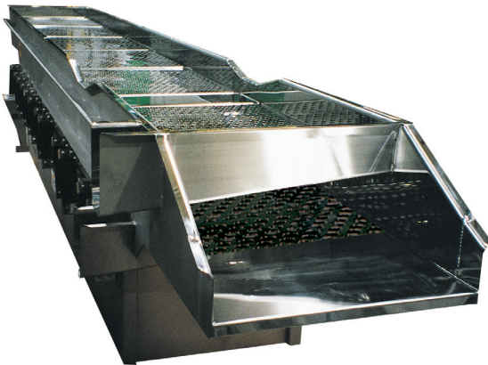
Conveying Second Decks