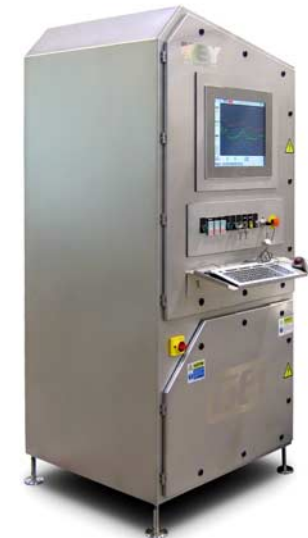
G6 Control Module

In the USA/Canada: 509-529-2161 or e-mail upgrades.info@key.net